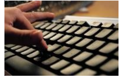
And more typing...

If you have not renewed by July 31st, I will be removing your name from the